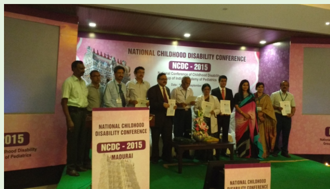
NCDC 2015 AT MADURAI.