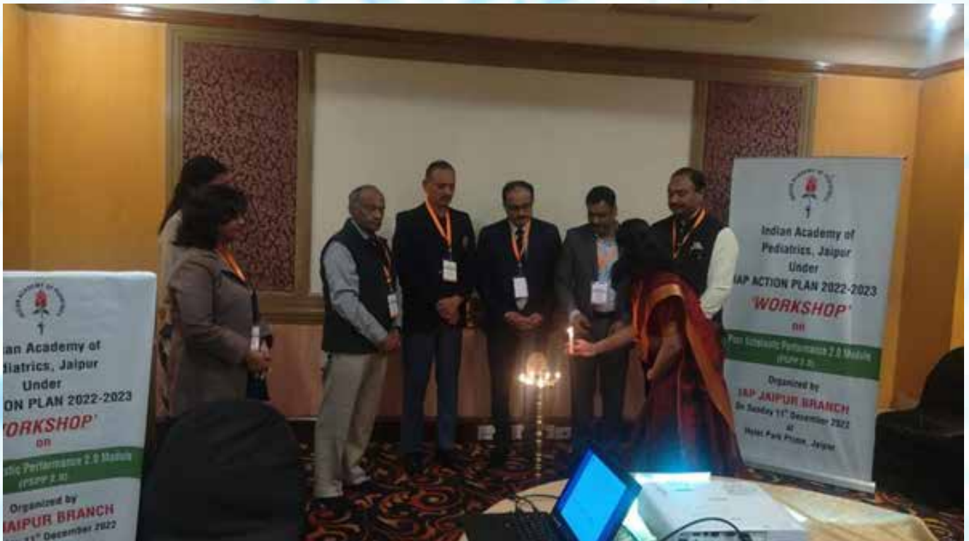
PSPP2.0 workshop at Jaipur