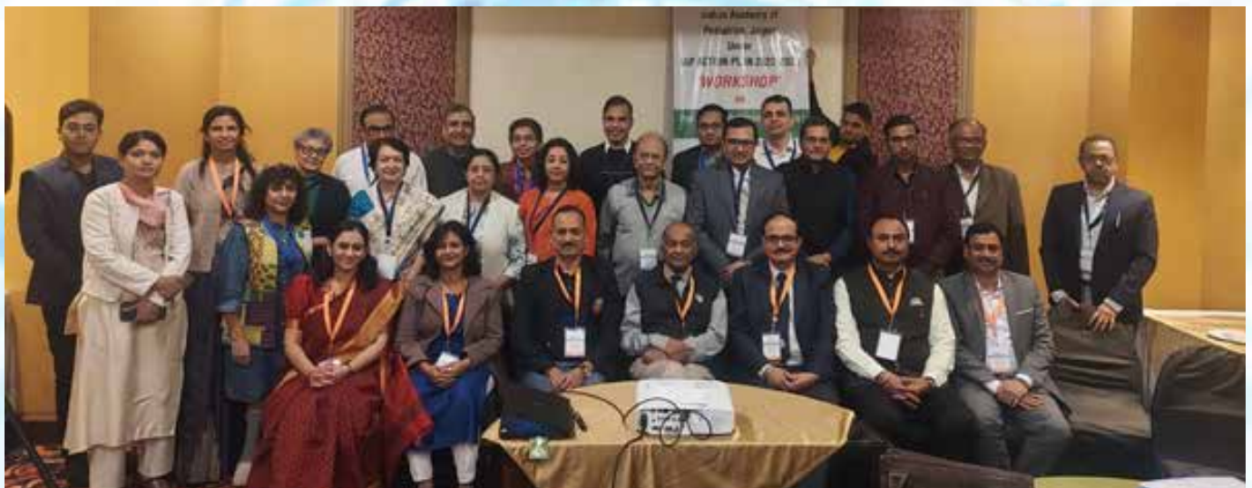
PSPP2.0 workshop at Jaipur