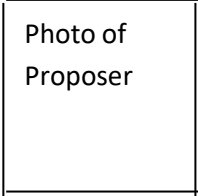
Photo of Proposer

Offices held by the candidate in IAP NDP & Year(s) .....