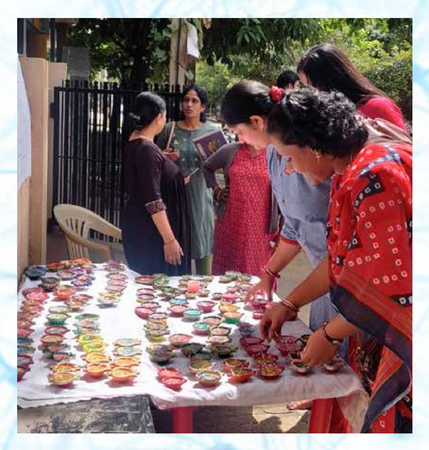
Children and staff of Sangsmitra and CCDD wish you all happy Dieali The children made znd sold diyas by setting up a stall outside the gate