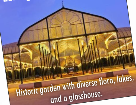
Lalbagh Botanical Garden

Historic garden with diverse flora, lakes, and a glasshouse.